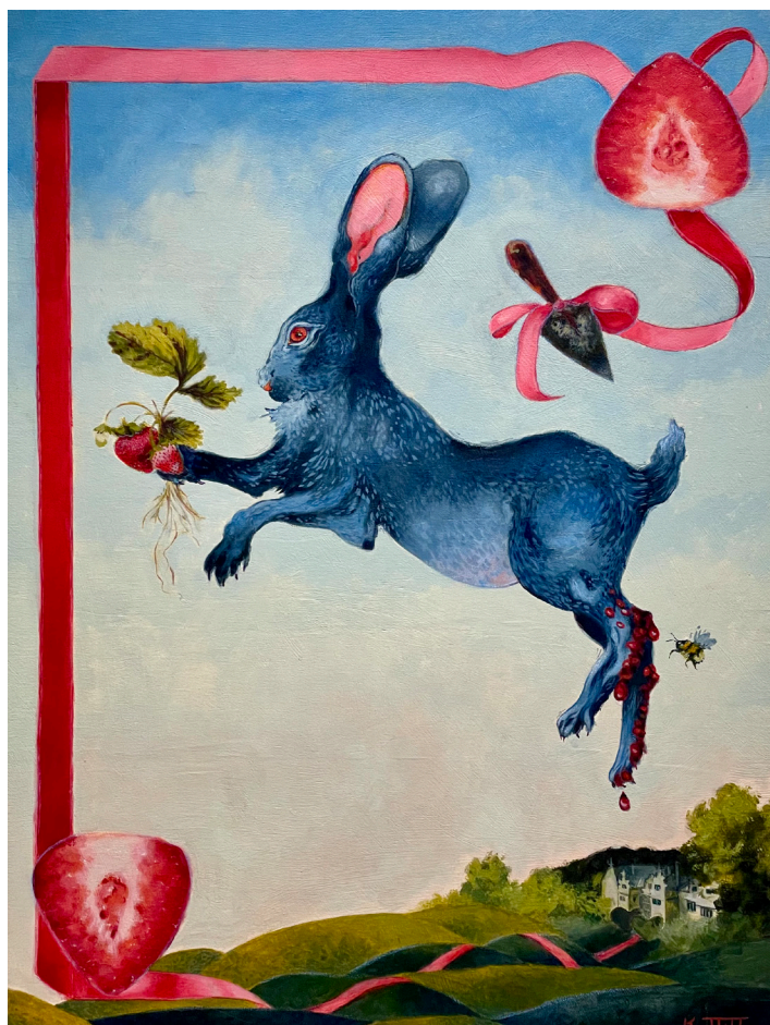
Kalley Tutt Jack of Strawberries 2024