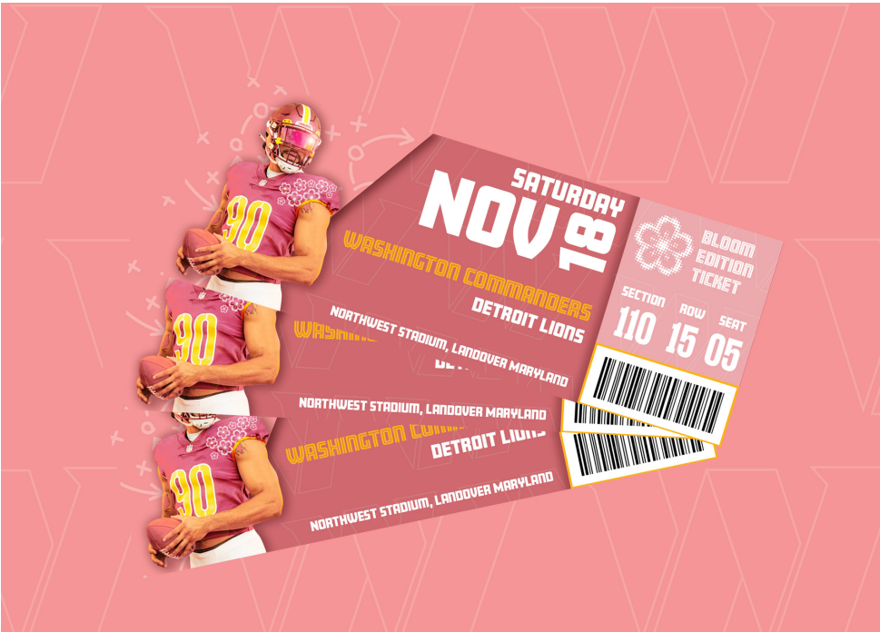
Kylie Pontes Back in Bloom 2025