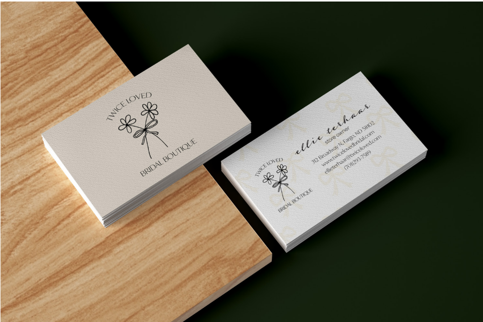
Ellie Terhaar Twice Loved Bridal Boutique 2025