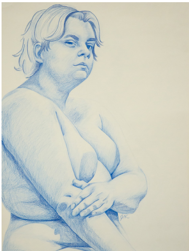
Jo Krull Blue Razz 2024